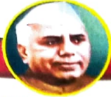
Hon. Yashwantrao Chavansaheb Founder